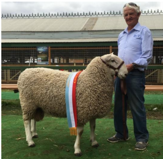
TALKOOK CENA 8/2014 F8447 Magnificent wool sheep Sired by Retallack 1107/2011 F5638