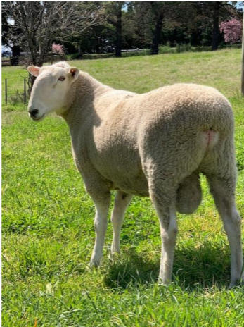
Mt Beckom 2017/0305 G502 Outstanding overall sire, with muscle, structure & confirmation.