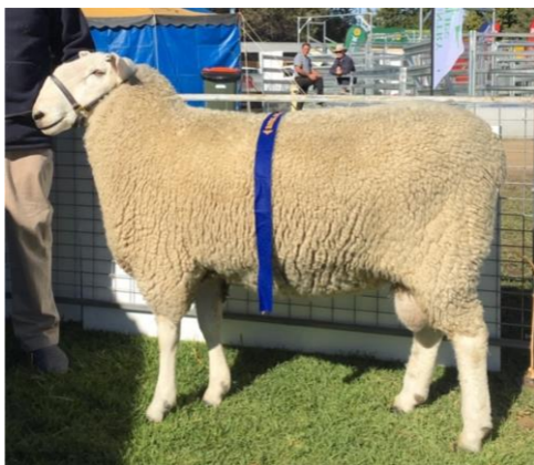
TALKOOK MOUNTAIN 28/2014 F8448 This ram is responsible for consistently producing huge eye muscle in any offspring he Sires His Sire is Retallack 215/2007 F1226