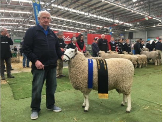
Talkook Arena 11/2016 Interbreed Objective Measurement Champion Australian Sheep & Wool Show Bendigo 2017 Sire: Talkook Mountain 28/2014