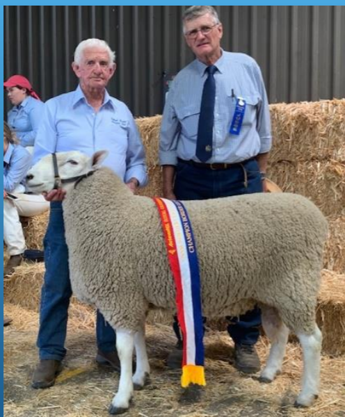
Supreme Longwool Champion Ram Canberra Royal 2020 Talkook Maximus 171/2018 Sire: Talkook Mountain